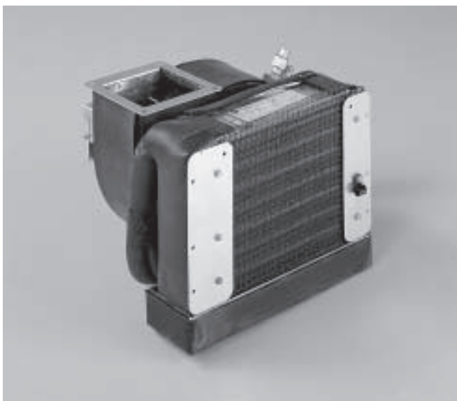
EBU7 Unit Shown