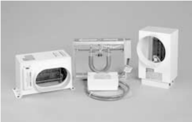
HMDL2-7, HMMH1 & HMBL2-7 Units Shown